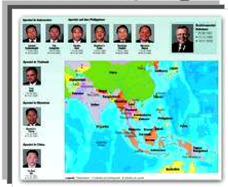
The District Apostle, District of South East Asia