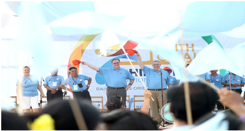
Taken from Bais, Negros.