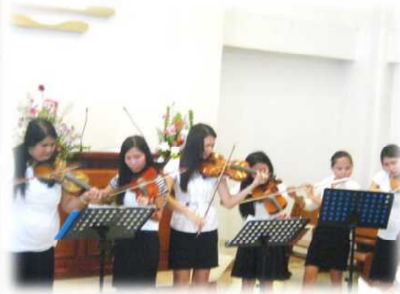
Sunday, 16 th June of 2013, held on Makati, father's day was celebrated.

The text word was about Being a first born, it was from Romans 8:29 : "For whom he foreknew, he also predestined to be conformed to the image of his son, that he might be the firstborn among many