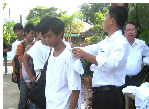
Distribution of NAC Youth T-Shirt

The night ends with a Prayer led by our District Apostle Hebeisen. On Sunday morning Priest Requilme and 3 youth from Nama Congregation led the morning exercise, and before heading to Asan Sur church, all youth received a youth day T-shirt.