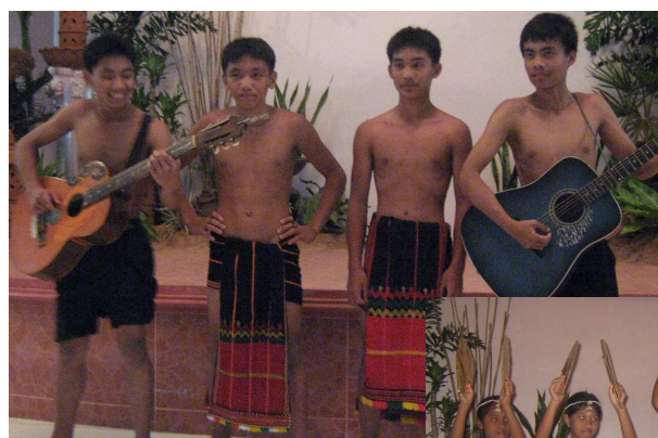
From Baguio (Happy Hallow) Congregation

S aturday, 30 th of August 2009, 100 young people from North Luzon ( Baguio, Calepaan, Nama, and Pangasinan South ) gathered in the Congregation of Asan Sur to attend the Divine Service for the Youth and 5 youth guests from Makati attended the Youth day. The games started before lunchtime then continued after eating. The games are: Hephep Hurray, Survival Games, NAC Pinoy Henyo, Tag of war in the water, and snakes. Everyone is excited, cooperative, and active in each activity. After all games the youth are free for swimming! In the evening, there is programs in which they are able introduce each youth, there is also a dance contest and all participants were prepared and present with their costumes.