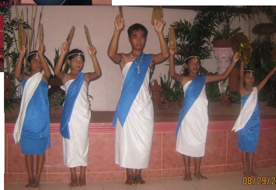
From Nama Congregation