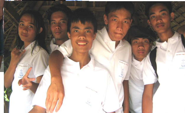
The Youth wearing the T-shirt