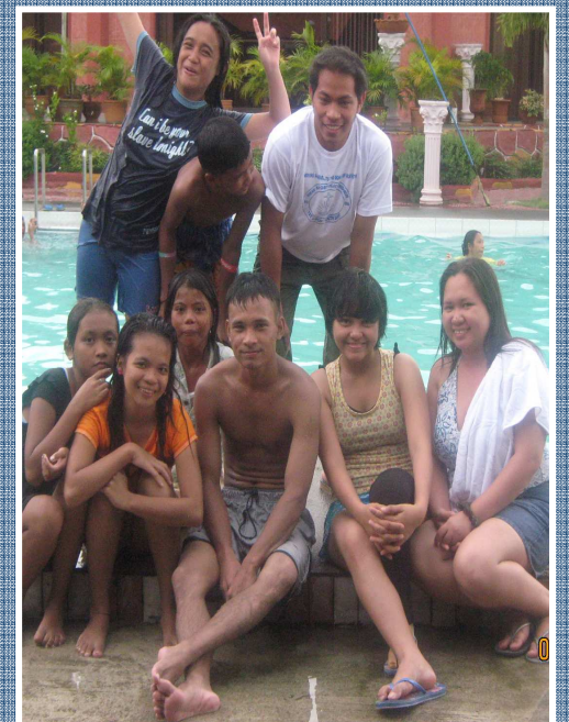
August 29, 2009 Puerto Paraiso Resort Bugayong Pangasinan