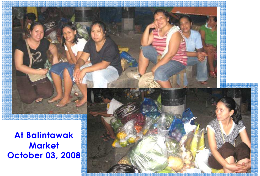
At Balintawak Market October 03, 2008

When we are in the bus going to the market we are still wishing and hoping that the rain will stop that nobody of us will get wet and have sick. Luckily, we arrived in the market and thanked God that the rain is not so heavy and there is also electricity in the place. We are happy that our prayer heard! And while we are looking for something to buy, the rain totally stop which give us more happiness.