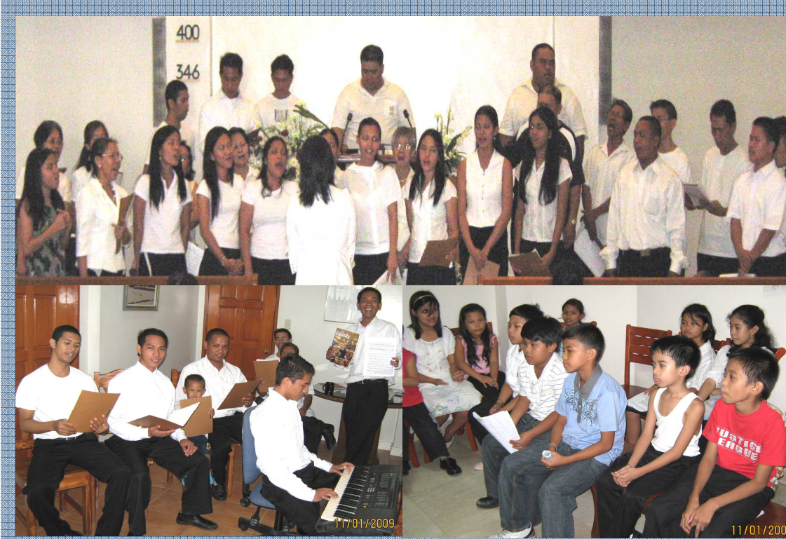
The Choir and Sunday School Children during their practice...