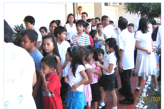
Falling in line for their lunch