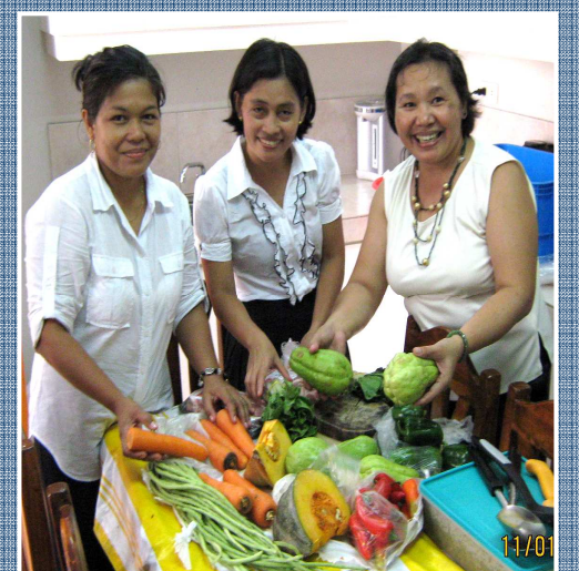
The Sisters preparing lunch for the Choir and Sunday school Children.