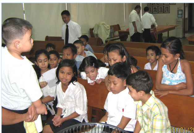
Sunday school Children

After their hard work, some sisters prepared a lunch for everybody. And after eating, they start practicing again until 3 o'clock in the afternoon. The day ends with a prayer, and go home with a joyful hearts.