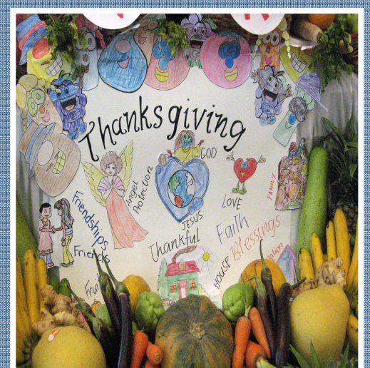
Makati Sunday School Children designed for the 2009 Thanksgiving Day