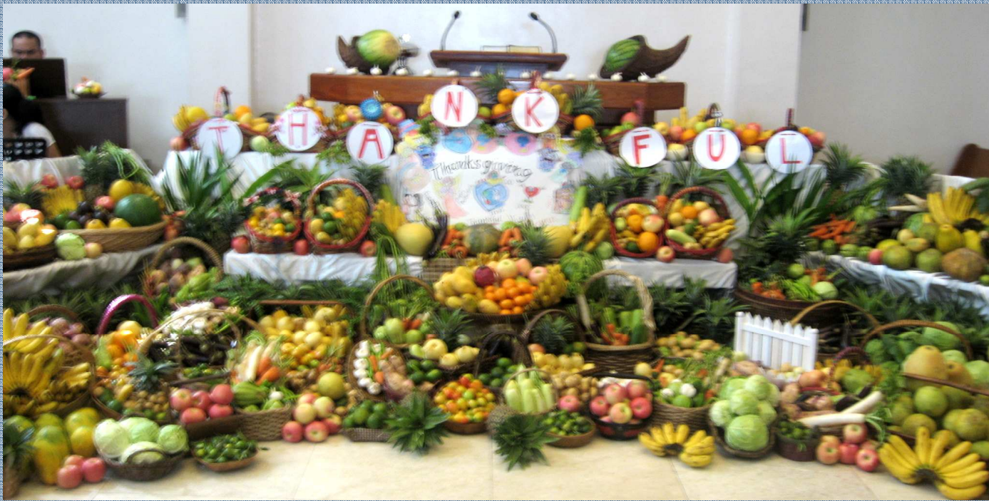
Thanksgiving Day 2009 - Makati Central Church