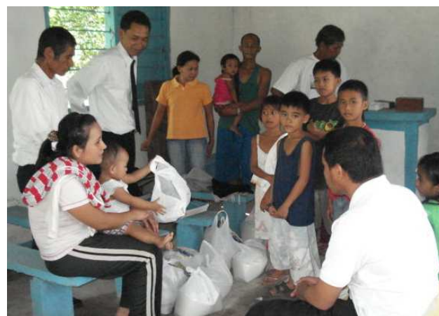
>>> Susuot Congregation (Pangasinan)

Northern Luzon was affected by Typhoon Pepeng, many of our members affected by the flood. Like, we did in Metro Manila area, relief operation was organized. Some of the Ministers went to Pangasinan to bring relief goods for the family affected by the Typhoon.