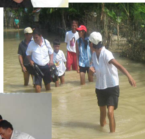
Flooded area <<< going to house of the members