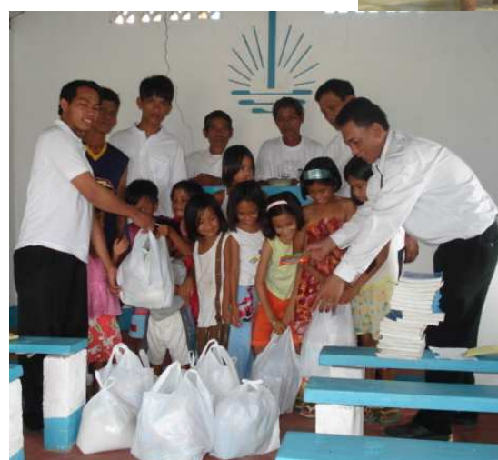
>>> Asan Norte Congregation (Pangasinan)