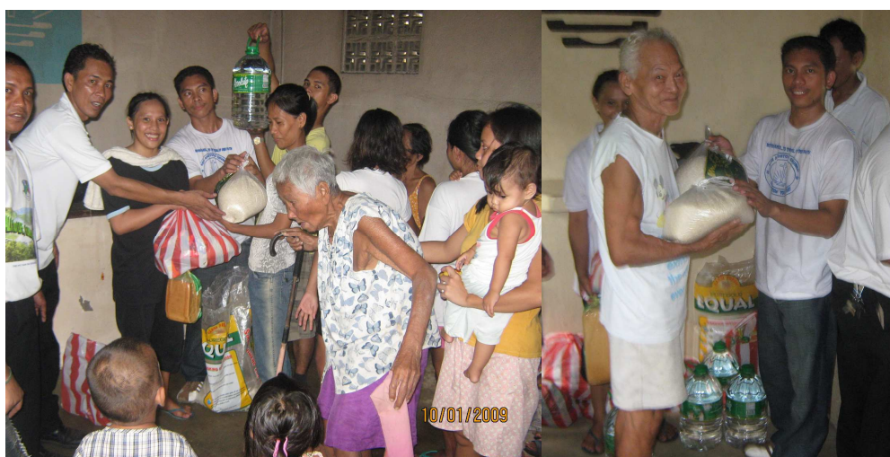
Members from Antipolo