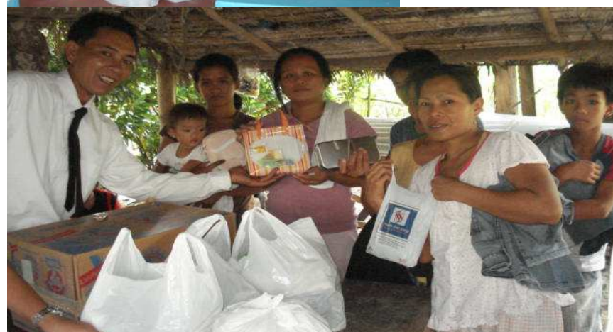
Giving goods and medicine for the affected family