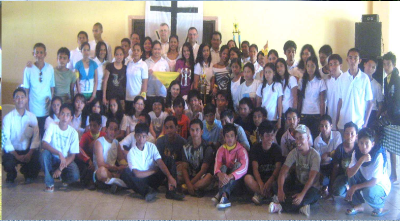
Luzon South Regional Youth Day • Daet, Camarines Norte • August 15 - 16, 2009