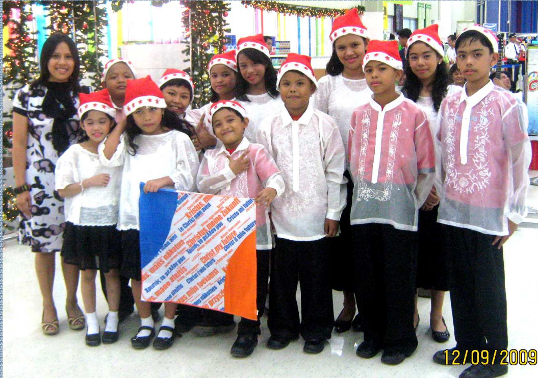
NAC Children's Choir of Makati Congregation