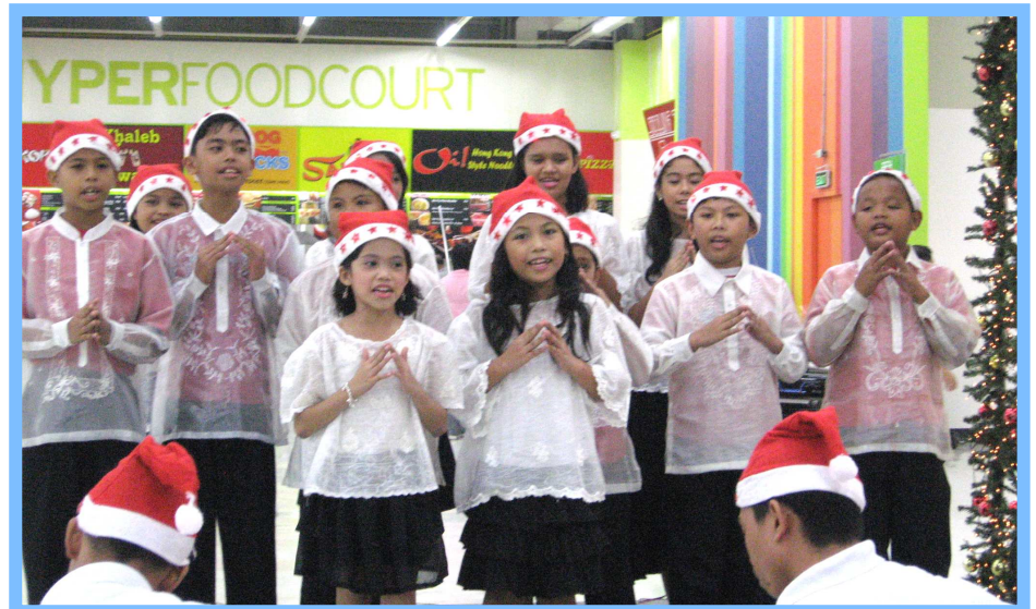
The Makati Children's Choir singing "Sa Araw ng Pasko" at SM Hypermarket.