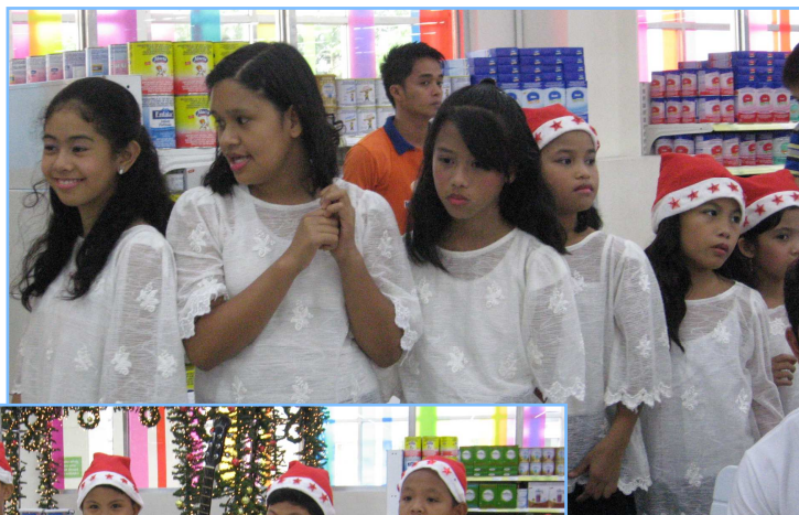
The Children's while waiting for their time to perform.