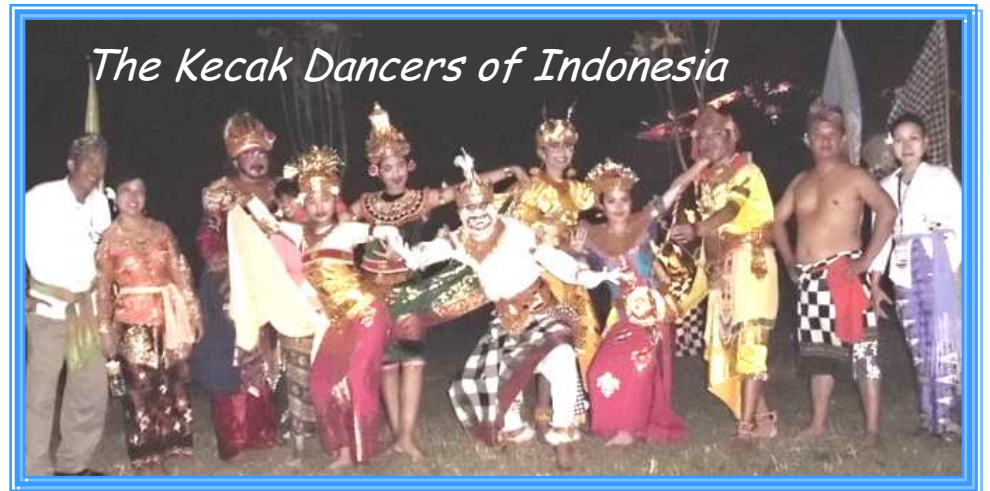
The Kecak Dancers of Indonesia

After that the youth join the celebration night. We watched the traditional "Kecak Dance" during the bonfire and the slide show. After that the youth return to their respective tents and took a rest for the divine service the next they.