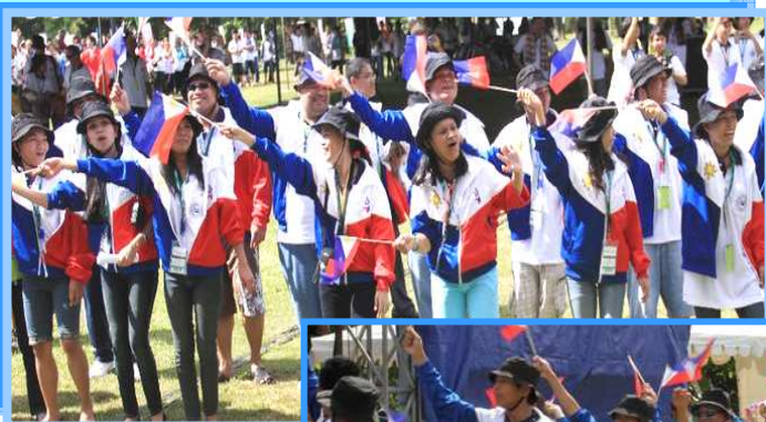
Philippine Delegates during the parade

After the Angklung program, the youth from different country show their talents in the "Asian Night" program. The Chief Apostle and the other Apostles enjoyed the performance of every country.