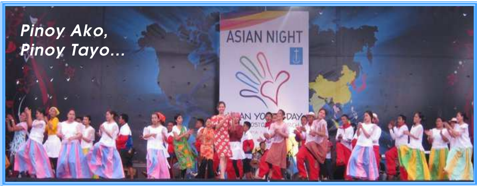
Pinoy Ako, Pinoy Tayo...

After that the youth join the celebration night. We watched the traditional "Kecak Dance" during the bonfire and the slide show. After that the youth return to their respective tents and took a rest for the divine service the next they.