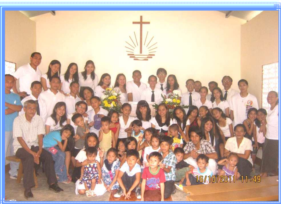
Amparo Congregation with Makati Youth

Midweek Service every Wednesday at 8:00 pm