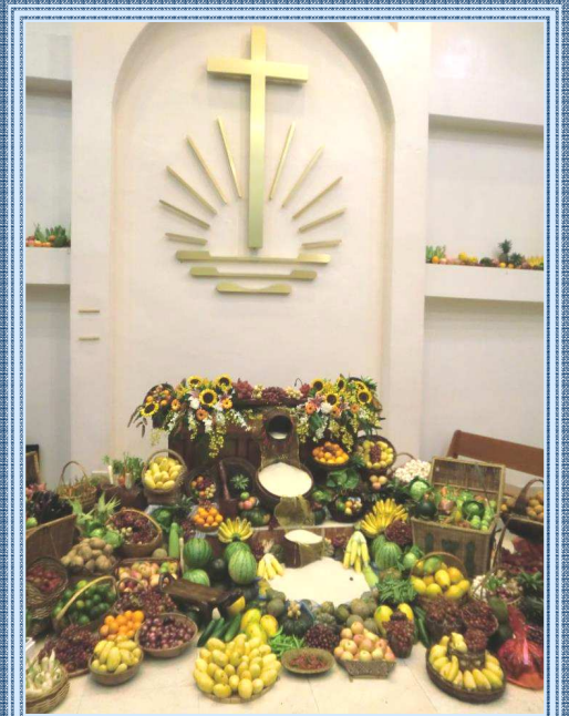
Thanksgiving Day 2011 Makati Congregations