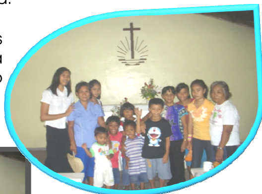
Quezon Province Thanksgiving Day 2011

The essence of it is to let us seek for a blessing and be a blessing to others and also to remain faithful. /GC