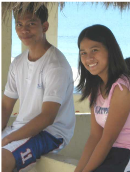
Happy Youth Faces