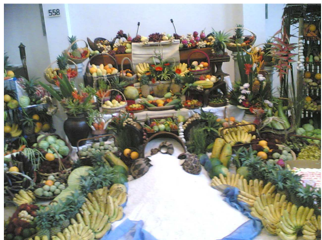
Thank you heavenly Father for the great blessings...