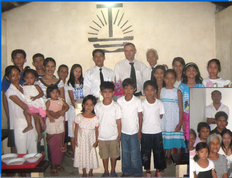
Apostle Wolf visits Abuyod and Salang Bato Congregations