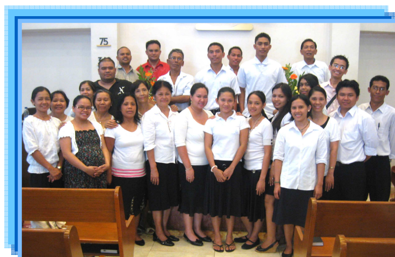
Makati Choir with 2 Indonesian Choir Leader

2 May 2010, two (2) Choir Leader from Indonesia visits Makati Congregation to observe and teach some techniques on singing. The choir was very thankful and very blessed that they gain more knowledge in music. The Indonesian Choir leader rendered a song for all.