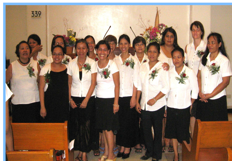
Mothers Day 2010 – Makati Congregation