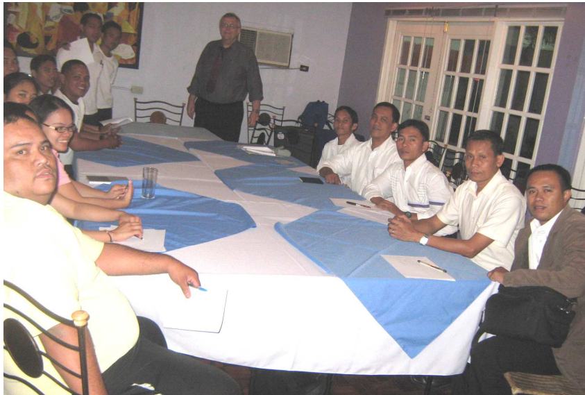
February 10, 2010 ■ Meeting in Le Delice

The flow of the service should also be considered such as the arrangements of seats, the partaking of the Holy Communion, and where the offering box should be placed.